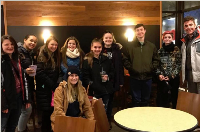
Youth Group Dinner at MarketStreet in Lynnfield