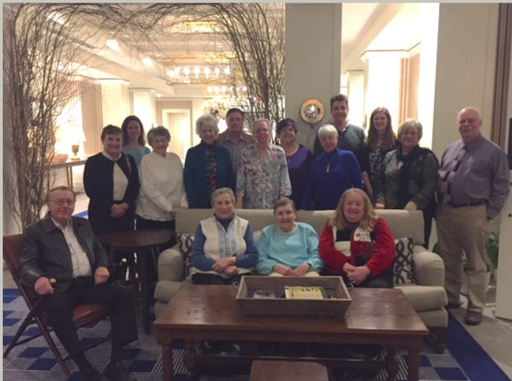
Leadership Group 2017