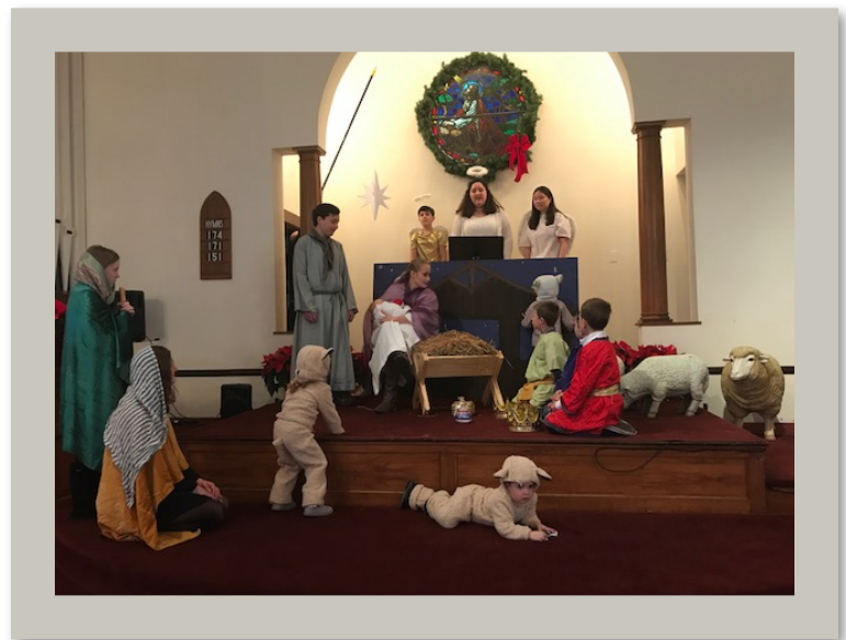
Children's Church Christmas Pageant