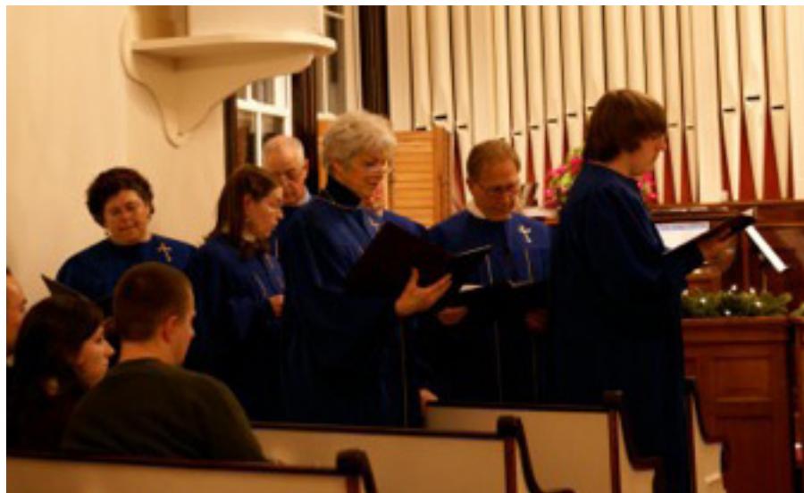
Choir sings on Christmas Eve.