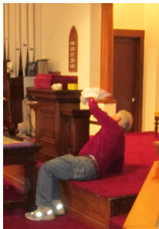
Spring cleaners at work at the church.