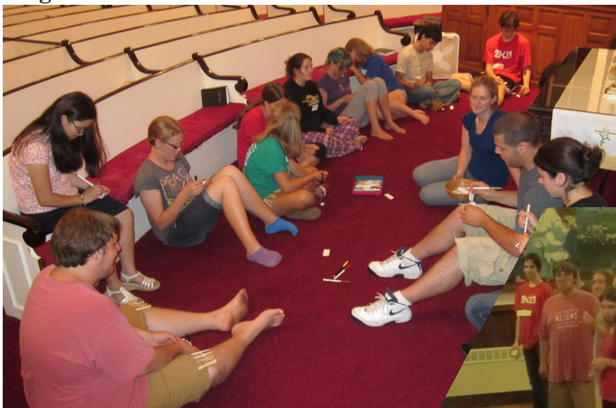
A High School Youth Group Lock in, left and below, at the church featured food, games, study, and reflection, but not much sleep.