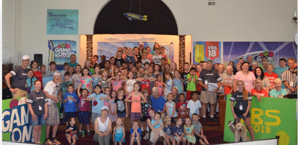
Game On! VBS 2018