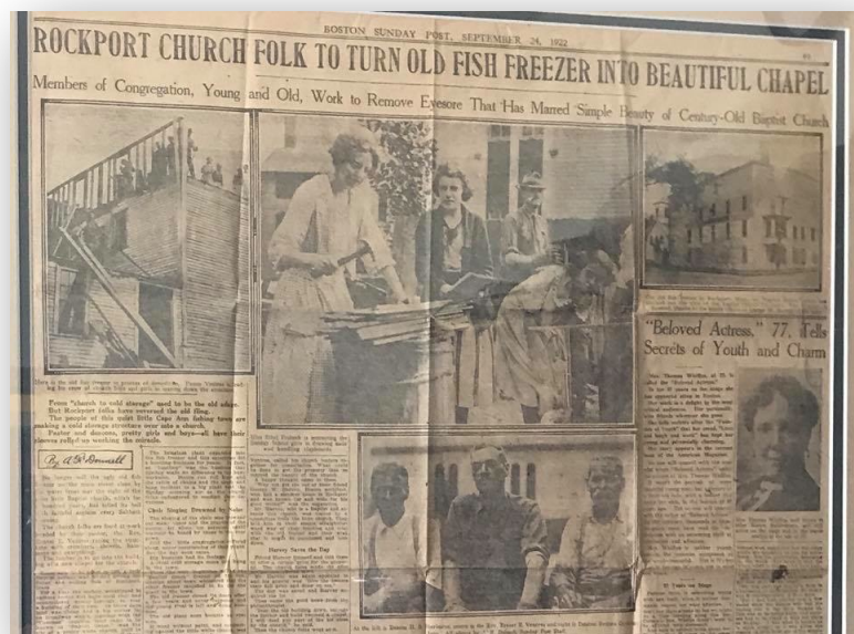
1922 article in the Boston Sunday Post describing the building of Ventres Chapel.

before Christ were many including: the blessing and provision allowed from the pagan King Cyrus, the servant leadership of Nehemiah and Ezra, the repentant and worshipful spirit of the Hebrew people and of course all of this being undergirded by the divine sovereignty of the Triune God. Children were once again taught the redemptive story of Yahweh and love of neighbor returned as the prevailing ethic. It was a grand time of celebration, worship and outward focused mission. This high point did not last long ultimately leading to the need for a better system – the New Covenant way of Jesus.