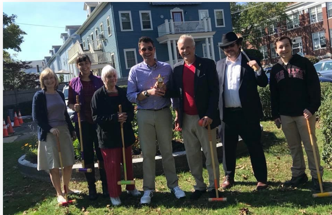
First Annual Church Croquet Tournament

2019 marks a year where we will prepare to cross the bridge into the twenties! Many of the people who have had the greatest influence on my life were born in the 1920s so I have an extra sense of awe and excitement about the prospect of living in this next round of twenties! For Rockport Baptist, the 1920s served as one of its highest times of growth and missional impact. This growth was seen tangibly in the church's property tripling in size and the building of what is now known as Ventres Chapel, the ladies