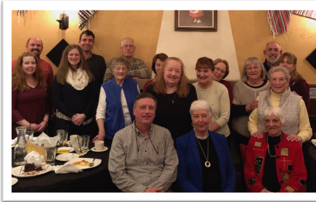
Leadership Dinner – January 2020