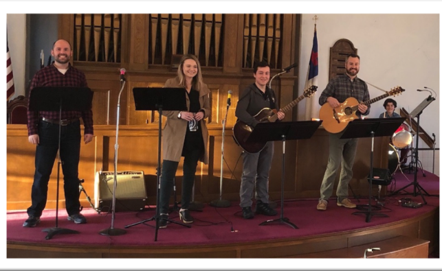
Worship Night – February 2020

All of this came to a crashing halt on March 15. We joined the world in the COVID-19 shut down. We find ourselves amidst pandemic which continues to rage across the globe and has enflamed a cascading effect of multiple points of anguish and misery. The history is still being written on what has become the most transformative global event since World War II.