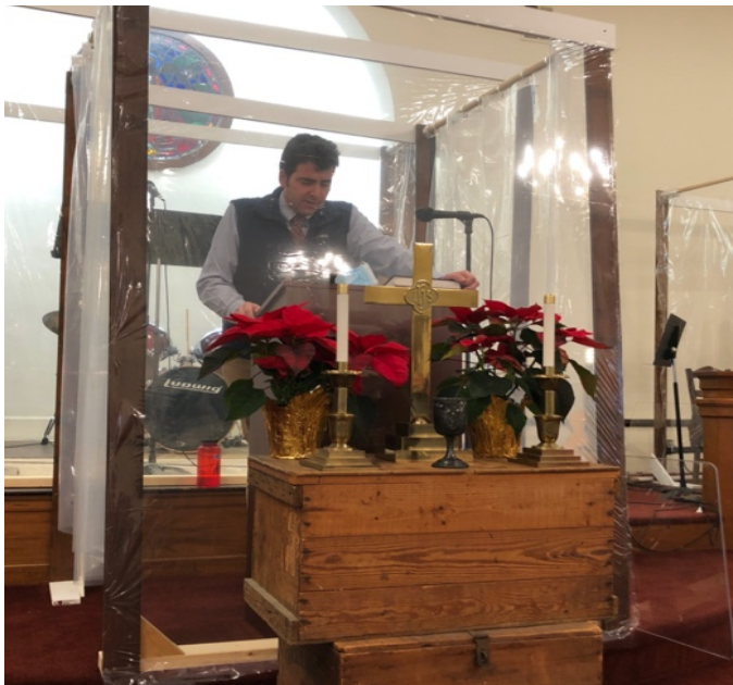
Preaching in December