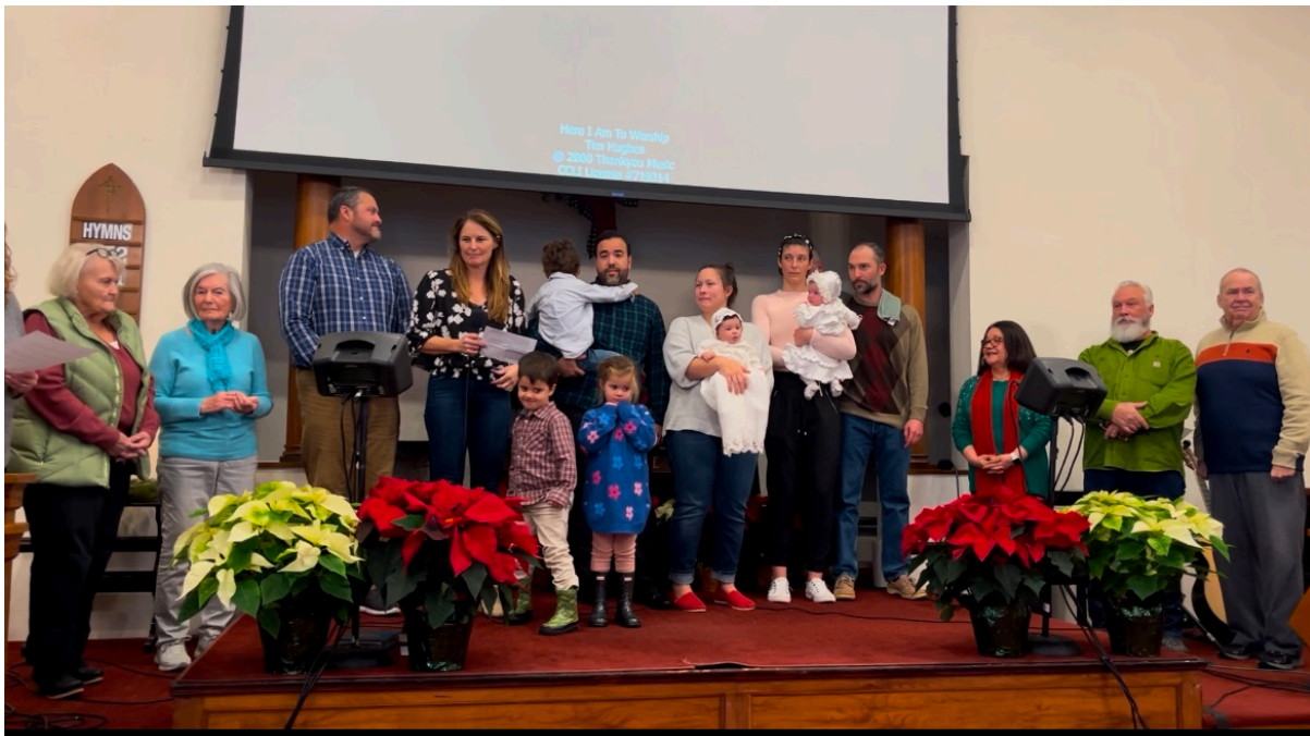
Dedication of Babies and Children unto the Lord!