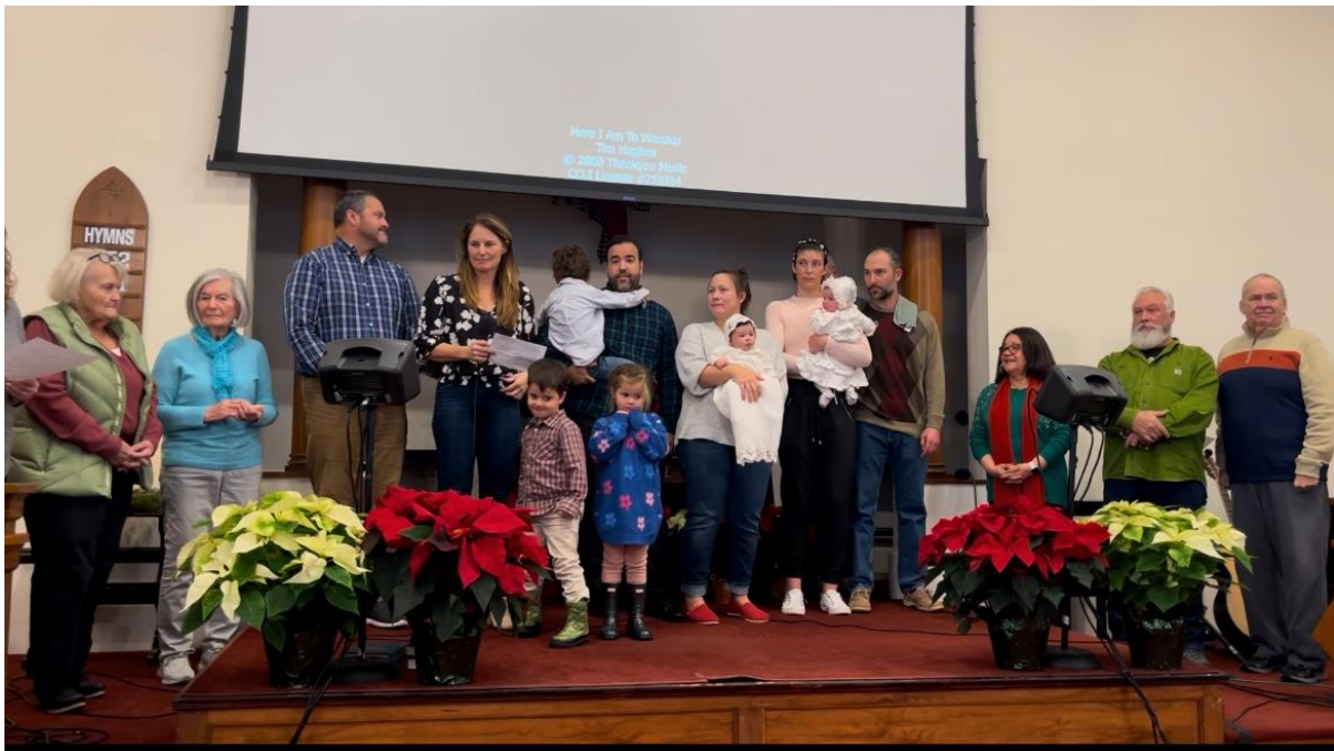
Dedication of Babies and Children unto the Lord!