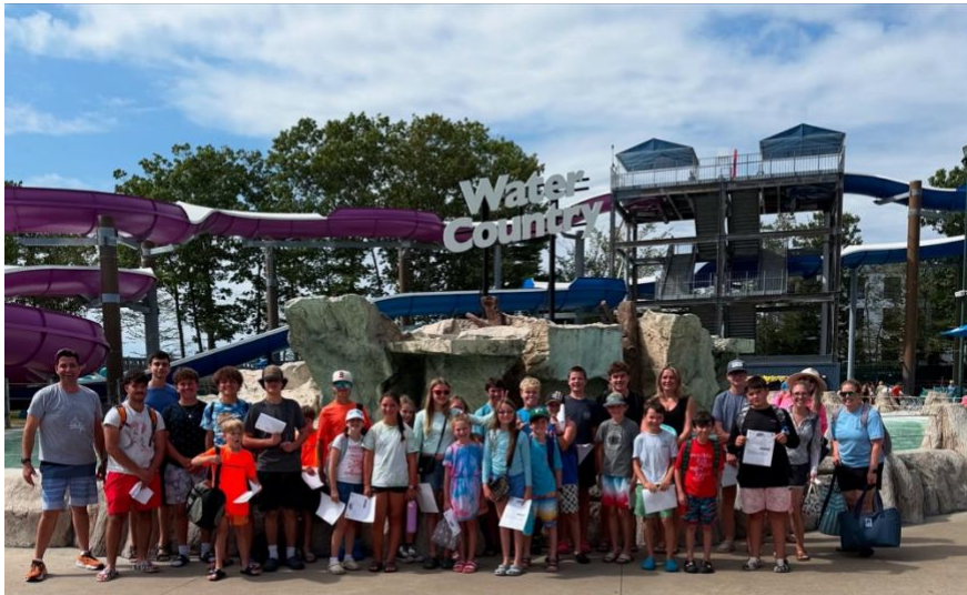
Youth Group Trip to Water Country (Portsmouth, New Hampshire)